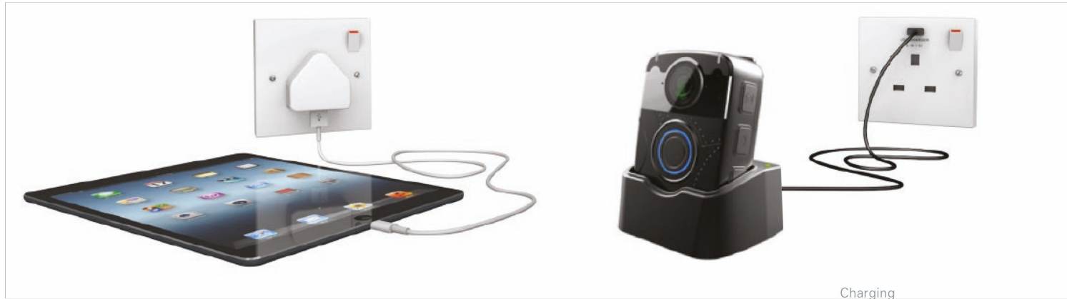
Charging External Depth 370mm

Charging and storage lockers for smaller devices. You can choose from powered or non-powered , mobile or static, there's a smart device solution to suit your needs. All powered units are available with or without USB sockets. Windows are available on all units excluding single door options.